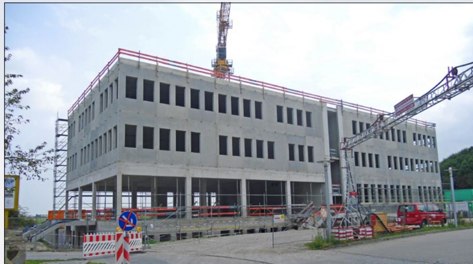
Image. The shell of the printing industry's new innovation centre is ready.

The anticipation of all the employees was clearly apparent as they excitedly looked over their new work places. This new innovation centre for our industry will be the only one of its kind anywhere in the world.