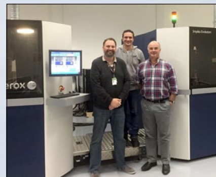
Image. Proud of regaining the PSD certification.