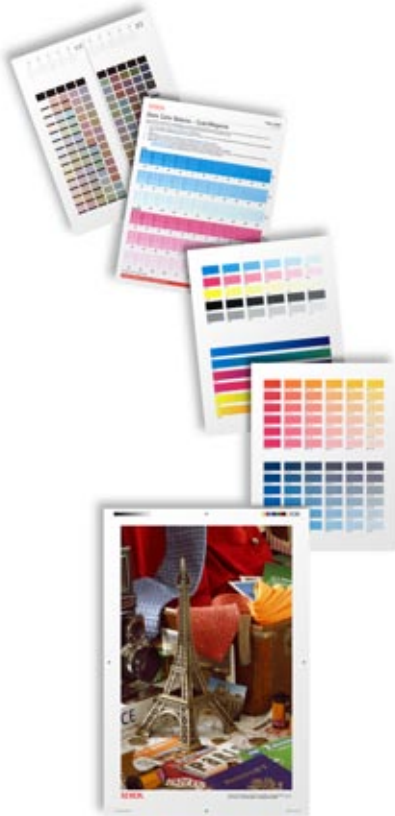
Built in colour calibration tools give you the final output you want.