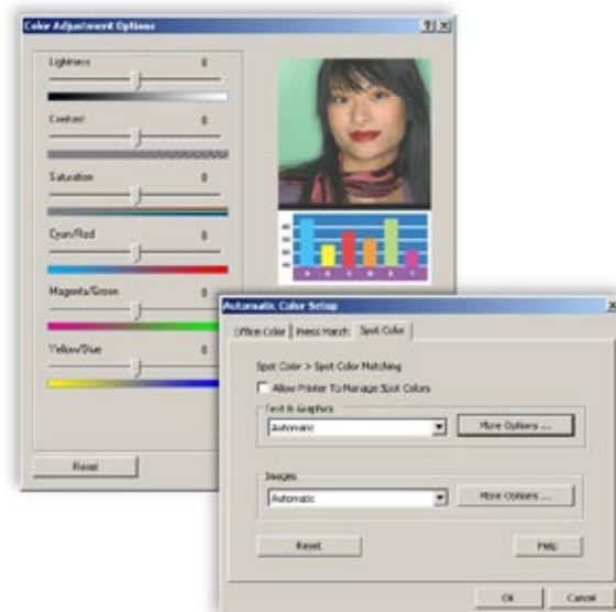
Advanced colour tools allow you to fine-tune output to your specifications.