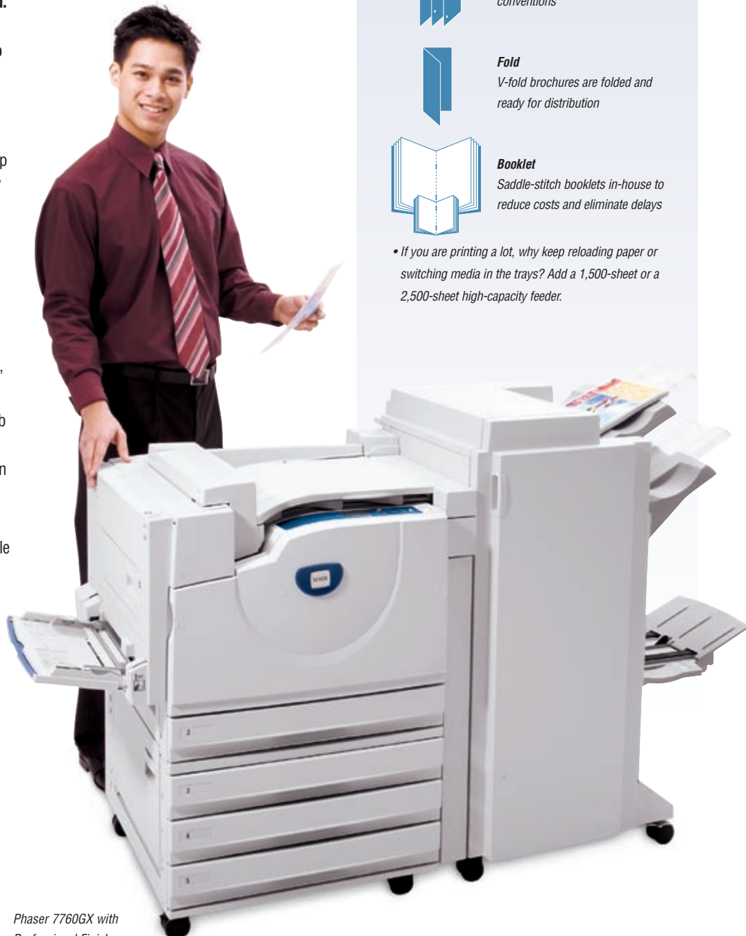
Phaser 7760GX with Professional Finisher