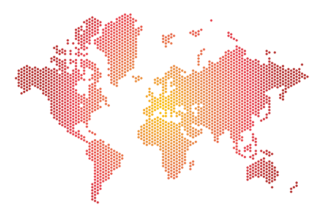
With over 70,000 registered EFI inkjet RIP licenses worldwide your Fiery XF system is compatible with the largest user base in the industry.

Over 70,000 registered EFI inkjet RIP licenses worldwide mean your Fiery XF system will be compatible with the largest user base in the industry, which makes color communication and exchanges of profiles, base linearization, and parameters with the complete supply chain easier than ever. Fiery XF contains a remote-proof container functionality that allows you to package all print-relevant job parameters and send them to any of the tens of thousands of installed sites to enable accurate remote proofing worldwide.