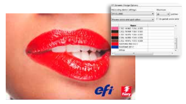
The EFI™ Dynamic Wedge™ controls image relevant spot and process colors in a small and effective strip.

Fiery® XF is a flexible and scalable precision RIP and color management workflow for proofing, package prototyping, and fine art printing.