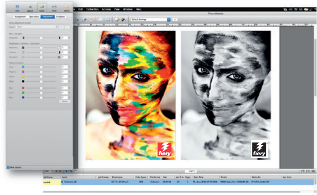
Color manipulations that guarantee the desired result

Do last-minute color adjustments or edit spot colors for the desired final result. The job-based optimization feature allows sub-optimal paper profiles to be easily adjusted to improve output quality.